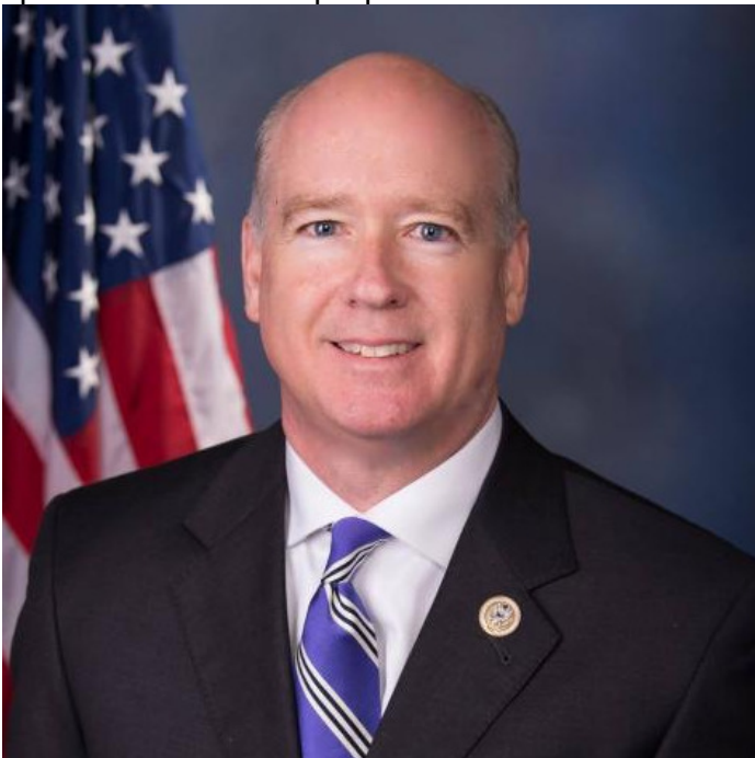
U.S. Congressman Robert Aderholt.

September 16 : U.S. Congressman Robert Aderholt will be our Club meeting speaker. A special meal will be prepared.