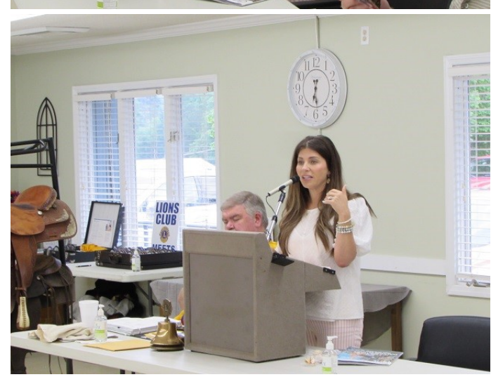
Page 3 of