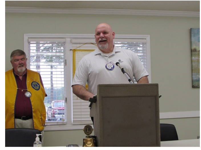
Page 1 of 5