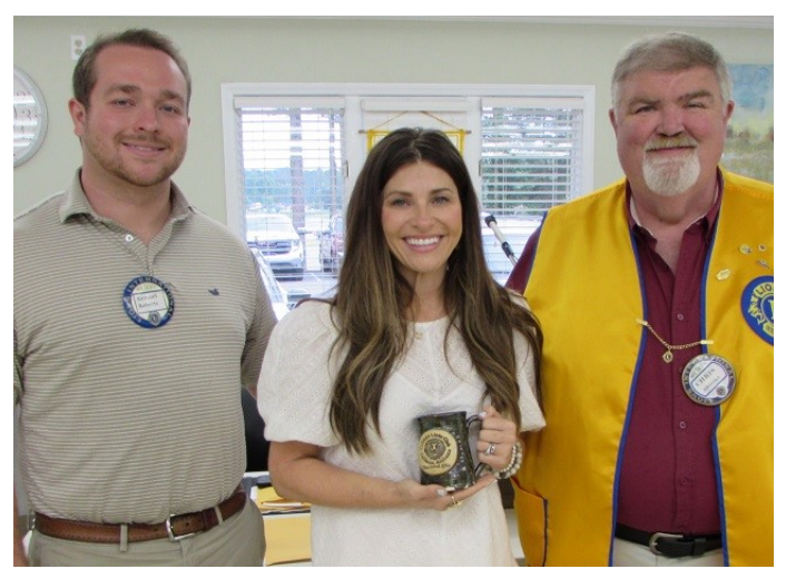
Page 4 of 5