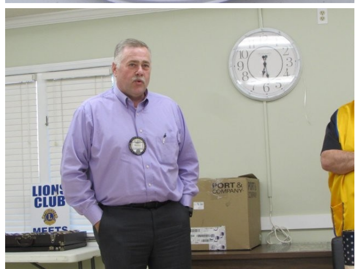
Page 3 of 8