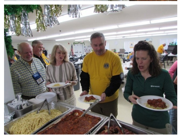
Page 2 of 8