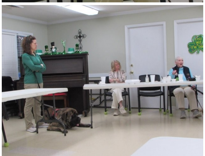
Page 7 of 8