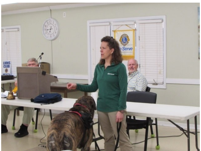
Page 5 of 8