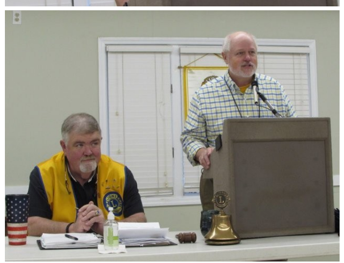
Page 4 of 8