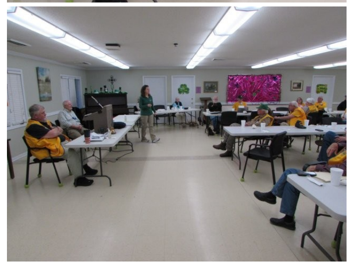
Page 6 of 8