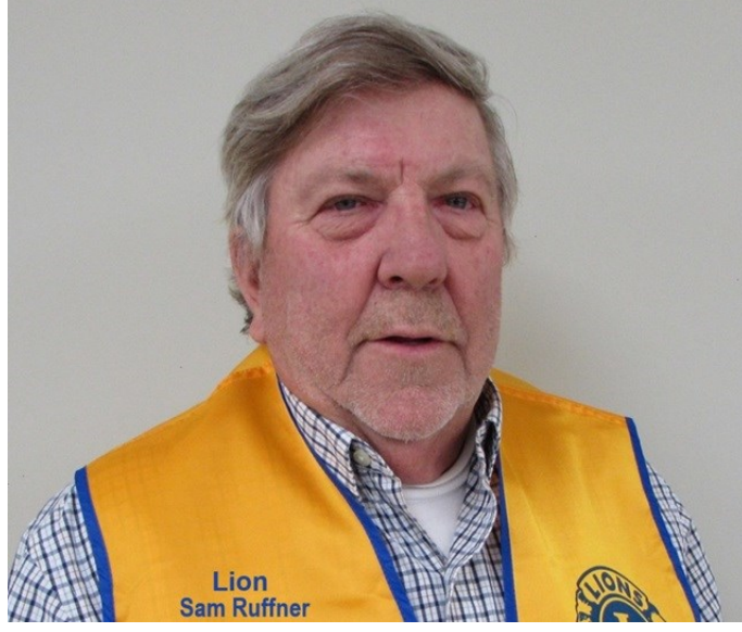
Page 2 of 2