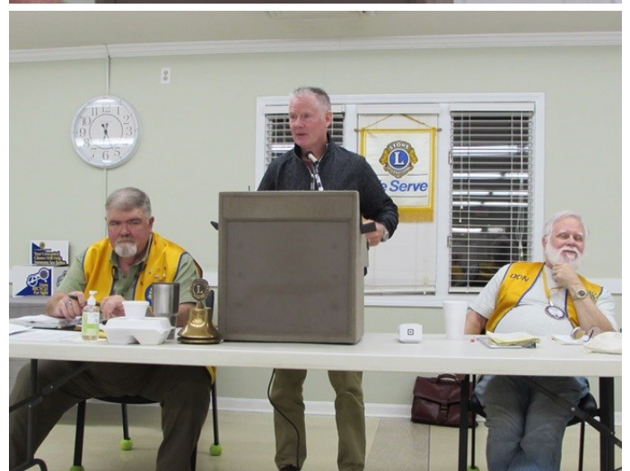
Page 3 of 4