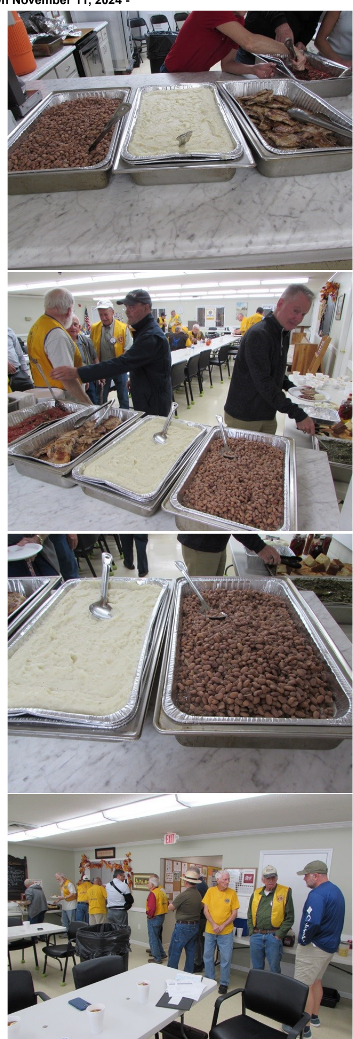
Page 1 of 4